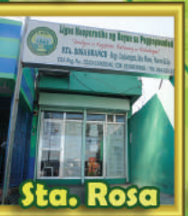
Sta. Rosa Branch