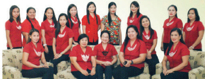
LKBP INTEGRATED SCHOOL, INC