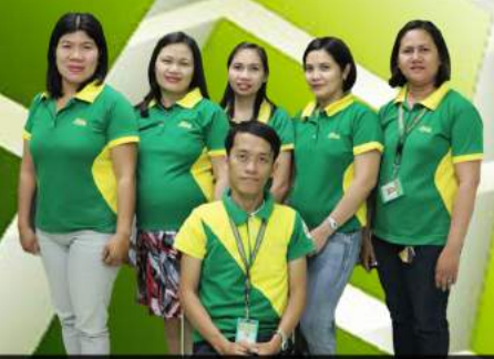
SAN MIGUEL BRANCH