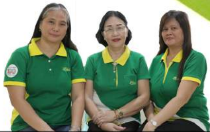
AUDIT AND INVENTORY COMMITTEE