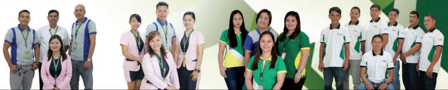
ASSET MANAGEMENT GROUP