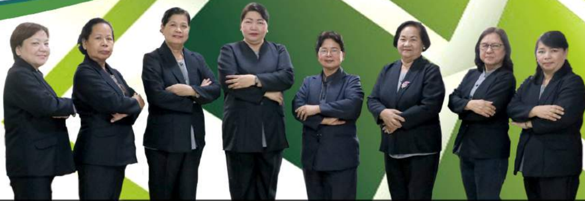
LKBP BOARD OF DIRECTORS & GENERAL MANAGER