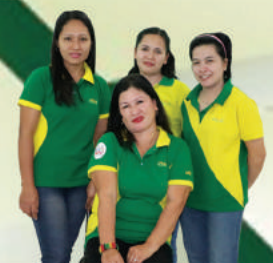
LKBP GARMENTS, INC