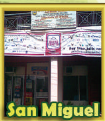
San Miguel Branch