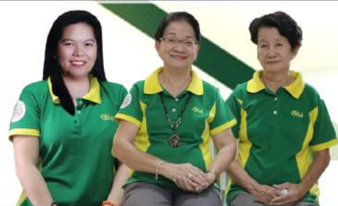
ETHICS AND GOVERNANCE COMMITTEE