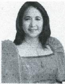
MA. VICTORIA R. SY-ALVARADO Representative 1st District, Bulacan